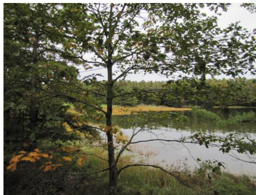
Kennebec Horse Farm, October 5, 2013

PLEASE NOTE – Coggins within 3 years in state (6 months out of state) and Rhino/flu shot within past 12 months are required by Kennebec Horse Farm.