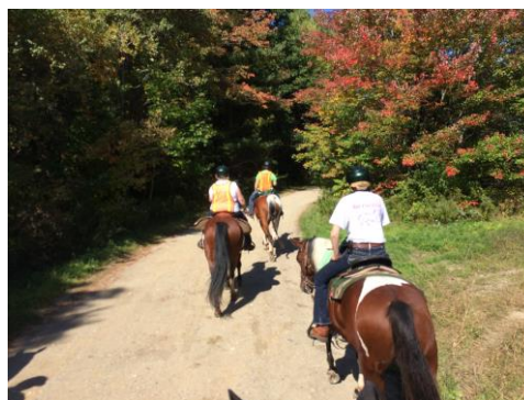
Blazin' A Trail For A Cure, September 27, 2014

The deadline for submissions for the November issue is October 22. Send your email address if you would like to receive this newsletter via email. Photos and tips are welcome! Send to: Trudy Bickford 36 Old Portland Road Auburn, ME 04240 Email: trudybickford@mainetrailriders.com Phone: 207-720-0550