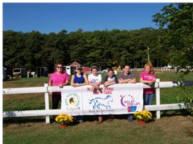
Blazin' A Trail For A Cure, 2014