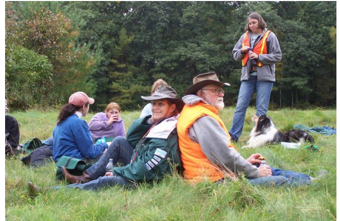
West Gardiner, October 4, 2009